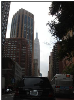
on our way to New York