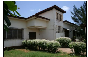
the fistula center and clinic

We will forever be grateful for our years on the m/v Anastasis and our time with the projects of Mercy Ships Sierra Leone; we have fond memories of the fistula centre and New Steps. The fistula centre and outpatient clinic for children has been taken over by