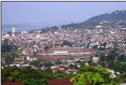
Freetown, Sierra Leone