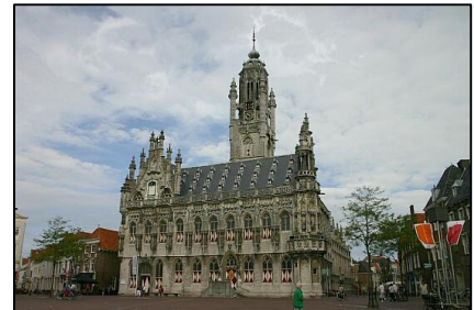
Middelburg, the Netherlands