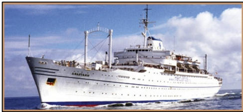
A beautiful ship – so many memories